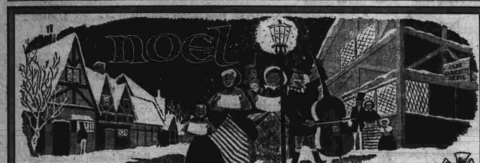
A Old fashioned Christmas of home with the family gathered for the singing of carols and the most important meal of the year... it's a happy scene in which we're pleased to play a small part... To our customers and friends, one and all, we wish a Merry Merry Christmas.